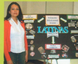
Posters encourage students to confront new, exciting issues.