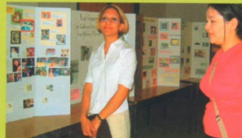
Displays allow space for testimonio and interaction with other students.