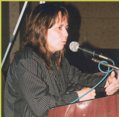
Writer, Cherríe Moraga, spoke at the Radisson Downtown. The event was co-sponsored by Brackenridge Lecture Series, UTSA Department of English, Classics and Philosophy, Trinity University, MELUS, and the Women's Studies Institute.

Moraga then proceeded to describe the process by which "the village" can be reclaimed. In a portion of her address that she seemed to have named "Writing against Amnesia," Moraga asked the crowd rhetorically, "How do we remain resistant to ignorance and open to the new?" Immediately, she answered: "Art!" Through art, and specifically, for Moraga, writing, Chicano/as confound attempts at "intellectual colonization," and begin constructing the authentic representation of the "tribe," which, she claims, is nothing more than "extended familia."